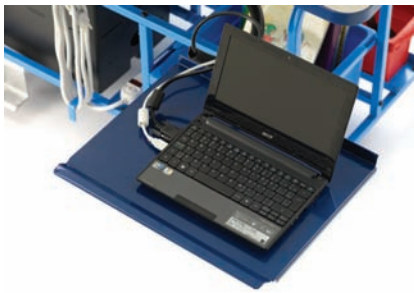
Retractable swivel laptop tray