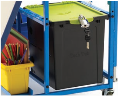
Tech Tub™ storage for tech devices