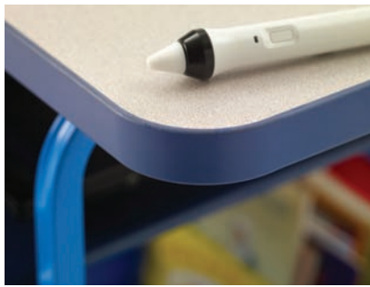
Durable surface with rounded corners