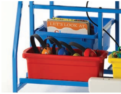
Small and Open tub storage for manipulatives